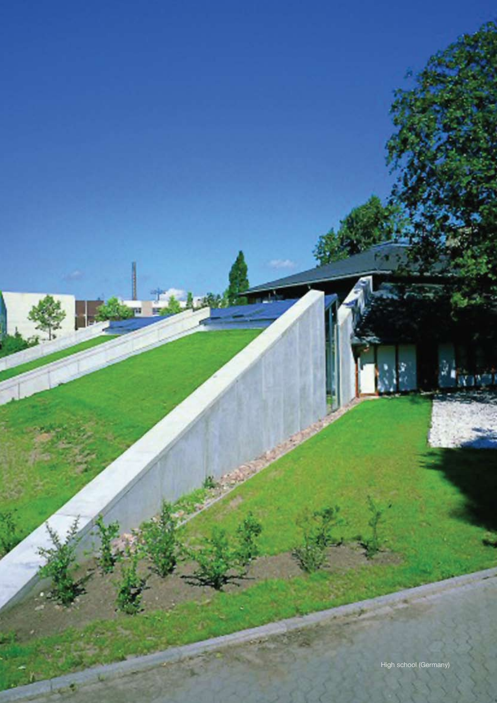
High school (Germany)