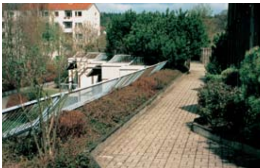
3 Old people's home (Germany)