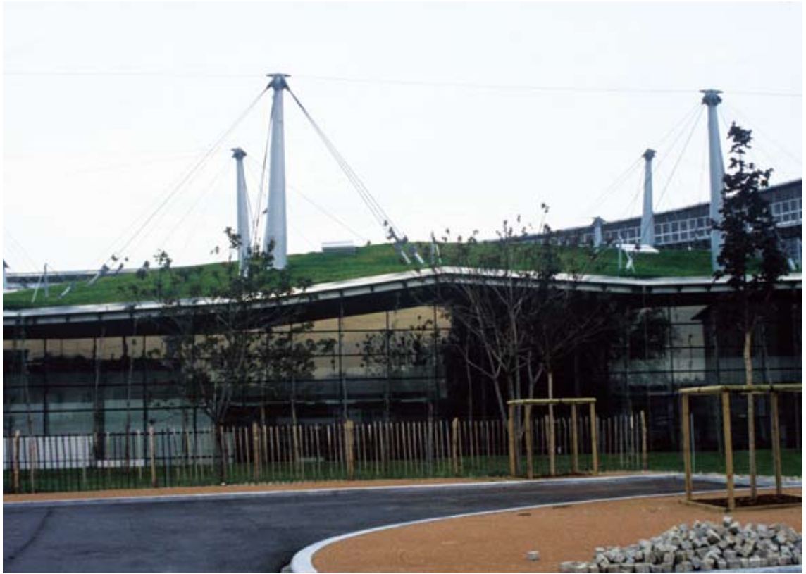
International Campus (France)

ALKORGREEN offers a complete, aesthetic and ecological system for your roof.