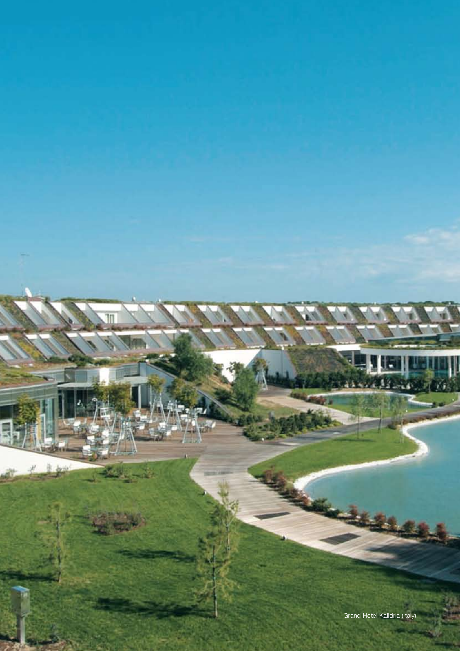
Grand Hotel Kalidria (Italy)