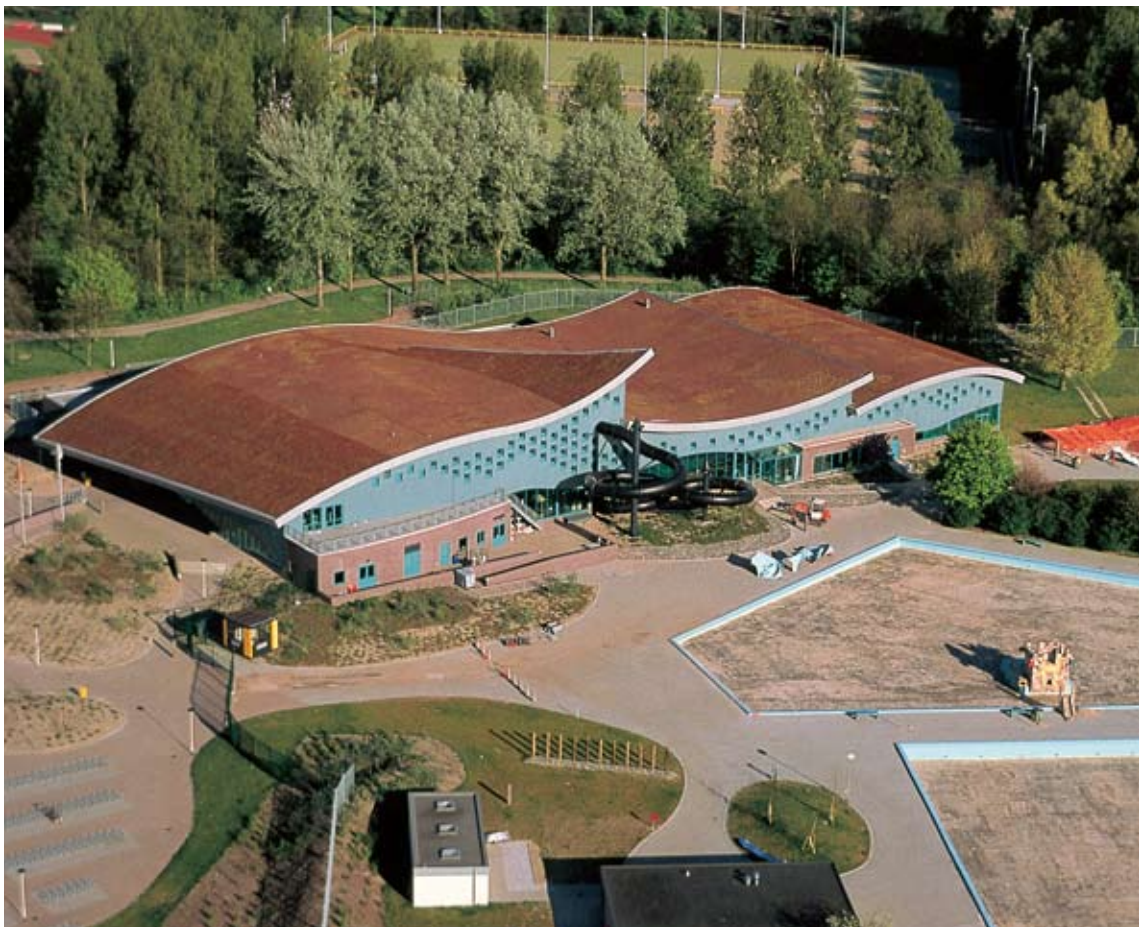
Swimming pool (The Netherlands)

The ALKORGREEN system offers a highly developed all in one green roof system, specifically adapted to our alkorPLAN® membranes.