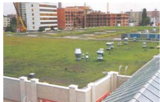
2 Shopping centre (Germany)