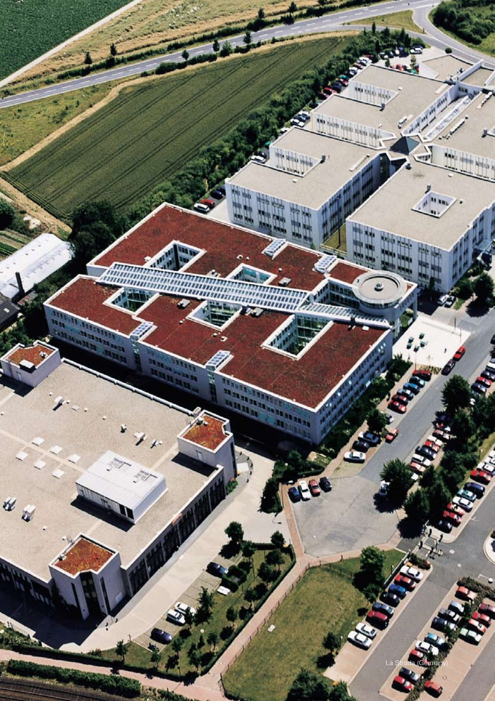
La Strada (Germany)