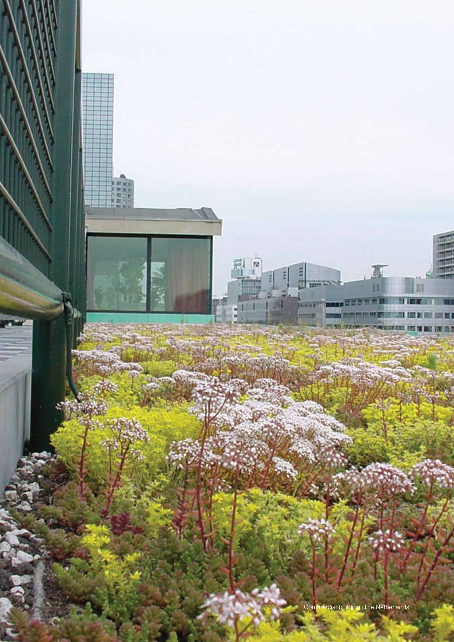
Commercial building (The Netherlands)