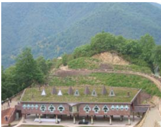
Nature investigation Centre (Spain)

This product provides a watertight roof and is totally unaffected by roots. Fully glued with adhesive alkorPLUS® 81068)