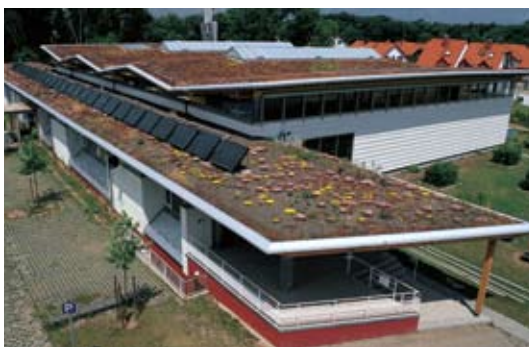
1 Sports Centre (Germany)

* Aggressive plants such as bamboo must be avoided on green roofs. For a full list of prohibited plant species, please refer to Krupka, Bernd. Dachbegrünung – Pflanzen und Vegetationsanwendung an Bauwerken. Stuttgart, Ulmer, . 2000