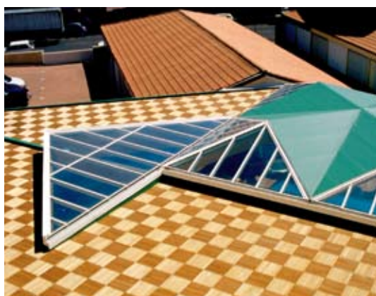
Restaurant Deleuil (France)

Store dry. Rolls to be parallel and in original packing where possible, do not stack in cross form or under pressure.