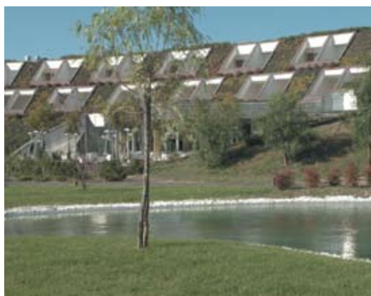
Hotel Kalidria (Italy)