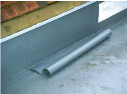
Fig. 3: Edge restraint with alkorPLUS ® 81170 metalsheet